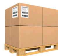
APL 60S 2 LABELS 3 pallets/min*

Due to our continuous improvement policy, our product specifications are subject to change without notice.