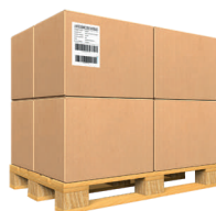
APL 60S 1 LABEL 10 pallets/min*